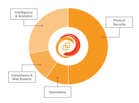
Calder7 is made up of more than 30 security experts

231 South LaSalle Street | 8th Floor | Chicago, Illinois 60604 +1 (312) 263-1177 | relativity.com